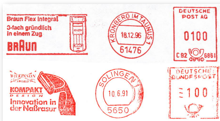
Those who have mastered shaving with a straight razor should achieve better results than with an electric razor or wet shaving with razor blades

barber - however: there are only around 1,200 people in Germany who practise this profession. You need a brush and soap - and a well-sharpened and honed razor. The specialist literature points out that razor burn can occur with blunt razors and/or insufficient hygiene; this is a severe skin irritation that leaves dark spots. Skin irritation should not be confused with pseudofolliculitis barbae and folliculitis barbae, both of which are inflammatory diseases of the skin - especially in people of subequatorial descent. Apple cider vinegar, camomile or aloe vera can help against razor burn after shaving.