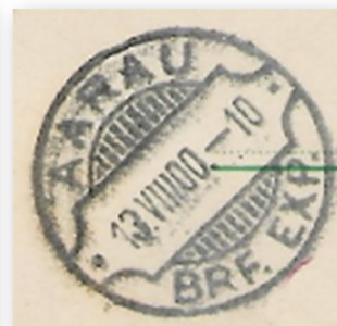
Philately also knows razor blades: here is a so-called razor blade stamp from Switzerland

mistaken: razors play an incisive [sic!] role in world literature: we think of Edgar Allen Poe, the writer who