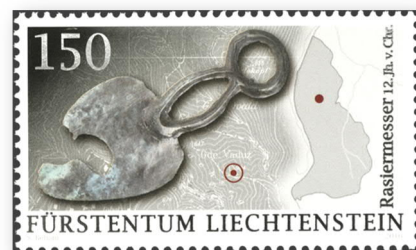
Razors have been around for a very long time, as this find from the Bronze Age in Liechtenstein shows

A wet shave with a sharp razor is much easier - those who love comfort will have this done by a