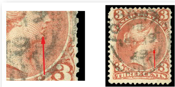
Varieties can also have something to do with shaving: here the well-known variety "shaving nik" on Queen Victoria's chin on a Canadian stamp

put bestial murders into words. His short story " The Murders in the Rue Morgue " describes how an Orangutan kills a woman while shaving.